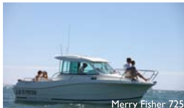
Merry Fisher 725