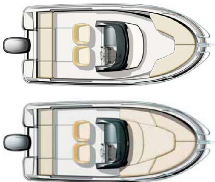
With large sundeck

Manufacturer's recommended price: 9.900 € VAT not included