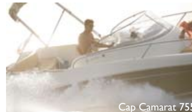
Cap Camarat 755